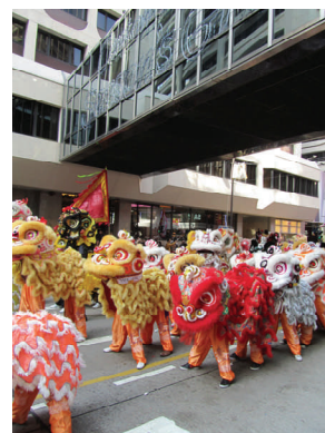
1,111 Dragon and Lion Dance in Hong Kong