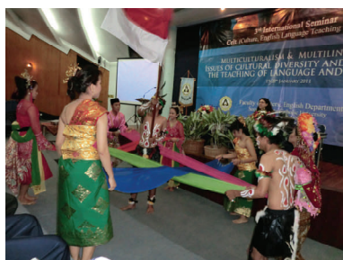
Opening ceremony, CELT conference, Semarang, Central

Speaking of our president, we found out that Blackberries (which are now ubiquitous in the country) are called “Obamas” in Indonesia.