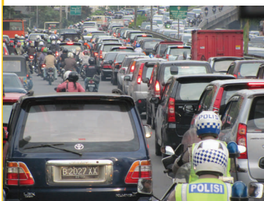
Rush hour traffic in downtown Jakarta on the way to the TV station.

Speaking of our president, we found out that Blackberries (which are now ubiquitous in the country) are called “Obamas” in Indonesia.