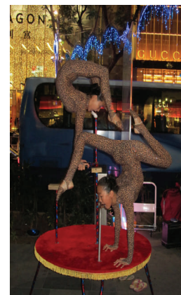
Street Performers on Orchard Road in Singapore