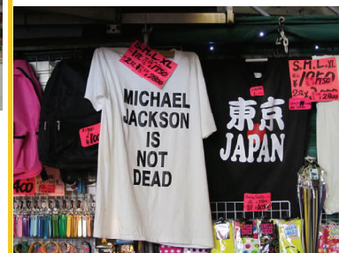
Harajuku t-shirt stall Tokyo, Japan