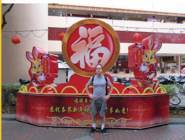
Chinese New Year Display in Singapore

One of my favorite places in Japan, Asia, and on the planet is Nara, a quaint Japanese town that is home to the Big Buddha of Todai-ji Temple. This temple is one of the largest existing wooden structures in the world and is home to Birushana Buddha, a symbol of Nara which dates back to 752 AD. While the temple has been rebuilt many times over and is now only two-thirds its original size, it is awe-inspiring. Another highlight in Japan was Tokyo's Harajuku which is home to all things pop culture, from the East and the West. My research of late has been on the T-shirt in popular culture and there was no shortage of them in Harajuku.