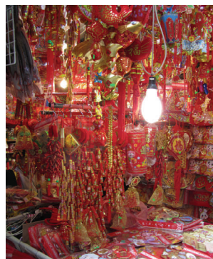
Temple Night Market Hong Kong

Off to Hong Kong...A high point of this stop was a visit to Temple Street Night Market for more research on the heavy metal T-shirt and the souvenir T-shirt. There was a plethora of both, everything from Obama to Black Sabbath! The New Year celebrations in Hong Kong were quite spectacular,