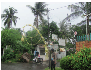
A quiet side-street in Jakarta.