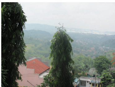
A view from Soegijapranata campus.